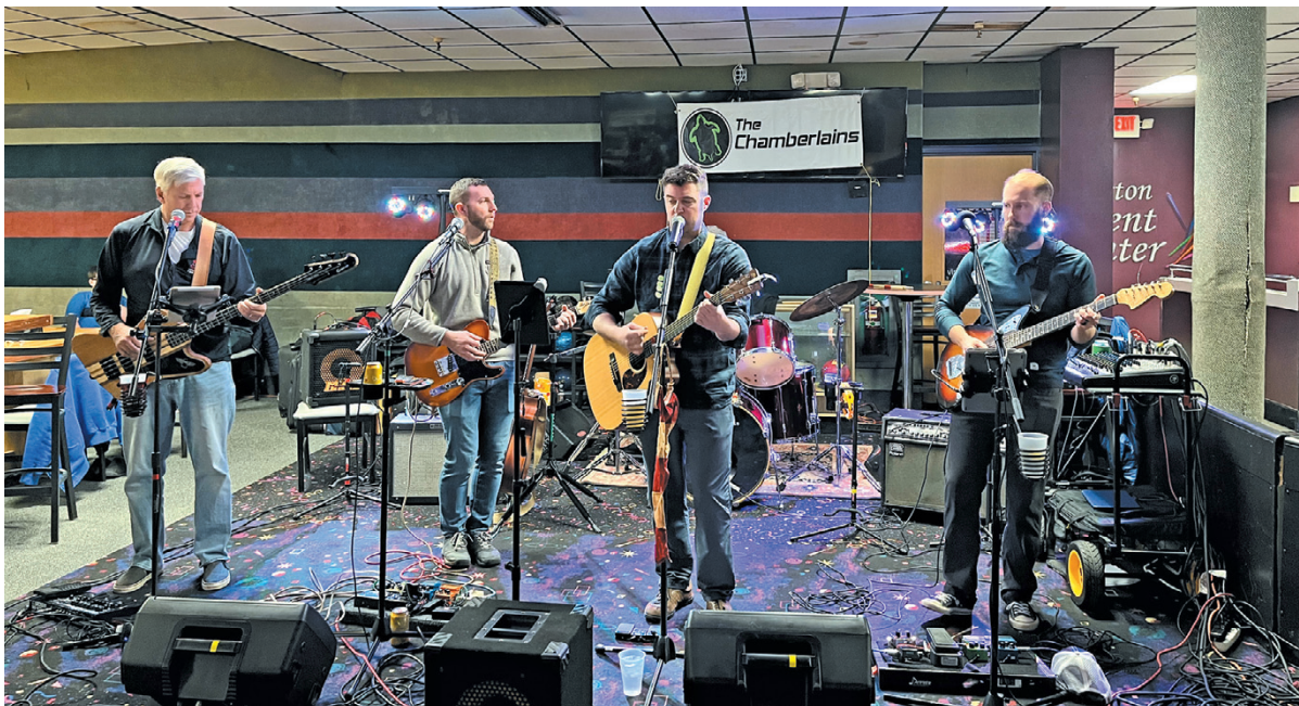
Pictured are images from a past "Strike Out for St. Peter's" event.